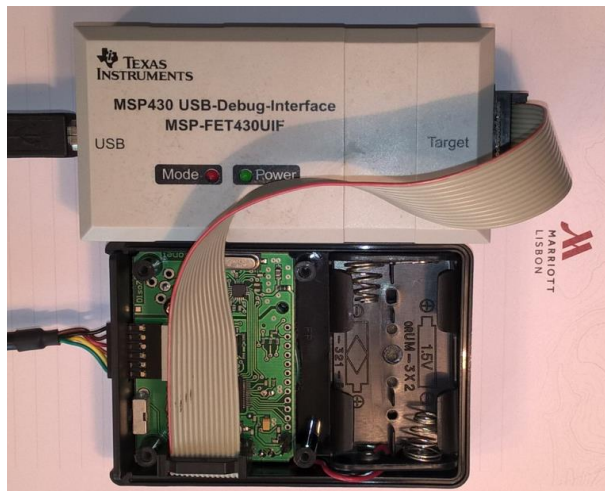
Figure 2. Connecting EMSPC11 to a PC.

Plug the programmer to the PC and connect its other end to the node. Also connect the node's UART to the PC, as shown in Figure 2. When you do that, you should see two new devices: /dev/ttyUSB0 (the UART) and /dev/ttyACM0 (the programmer). The numbers may differ if you happen to have other serial devices connected to the PC.